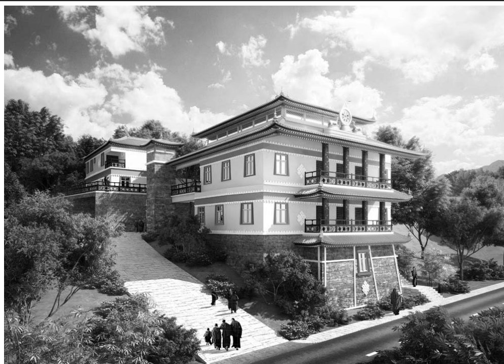
New Thrangu Vajra Vidya Monastery at Damansara Perdana (Artist Impression)